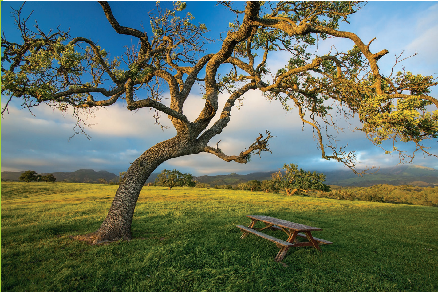
Springtime at the Fess Parker Home Ranch

Recent Press | The World of Parker Notes from the Head Winemaker | Wine Club | Release Day BBQ