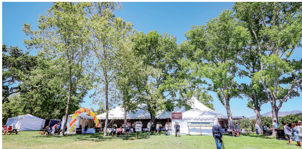
18 th Annual Wine Club Member Release Day BBQ