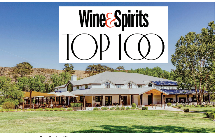
Fess Parker Winery