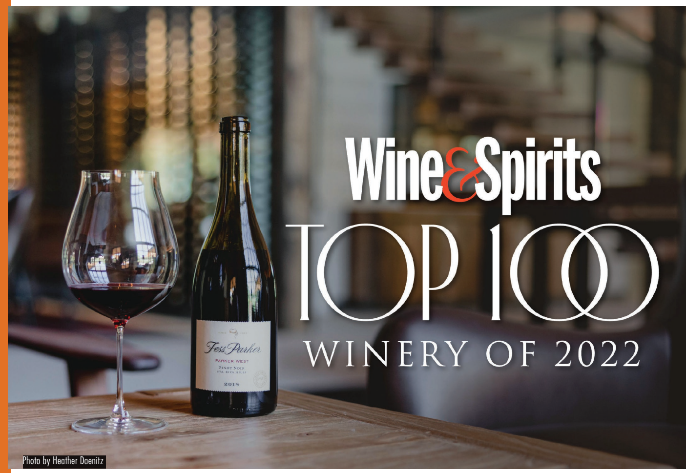
Fess Parker Winery has been selected as one of Wine & Spirits Magazine's Top 100 Wineries of 2022.

Recent Press | The World of Parker Notes from the Head Winemaker | Wine Club | Fall Tasting Events