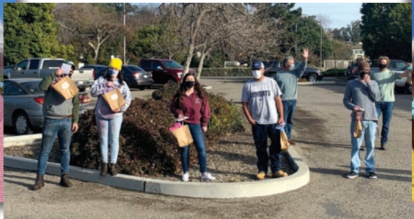
Our socially distanced Winery crew