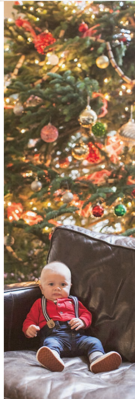
Theo already looks like a regular in the tasting room.