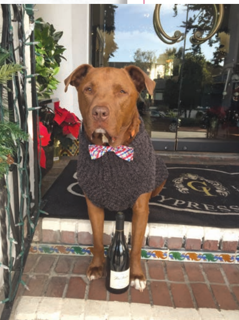
Some of us have four legged grandchildren, but fortunately Toby cleans up well.