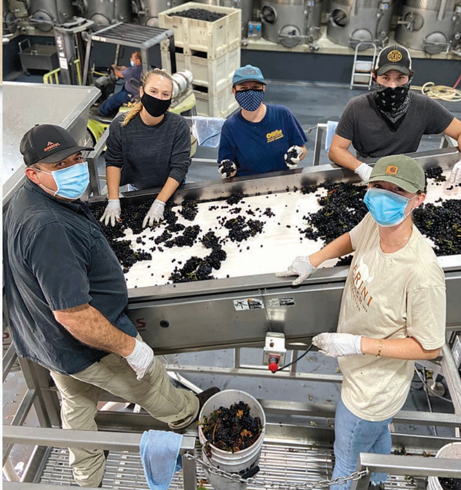
The winery team working the sorting table