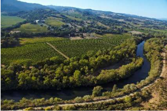
Rochioli Vineyard & Westside Road

New Westside Luxe Package Offers Extravagant Day in Russian River Valley Iconic Gary Farrell, Flowers and Rochioli Wineries partner with the internationally acclaimed Farmhouse Inn to create a luxury visitor package