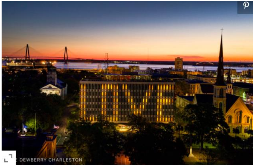
The Dewberry Hotel in South Carolina

The Dewberry Hotel is sending some love from its windows. The word "LOVE" is written out in letters, extending from the ground floor all the way to the top for a positive message over the streets of downtown Charleston.