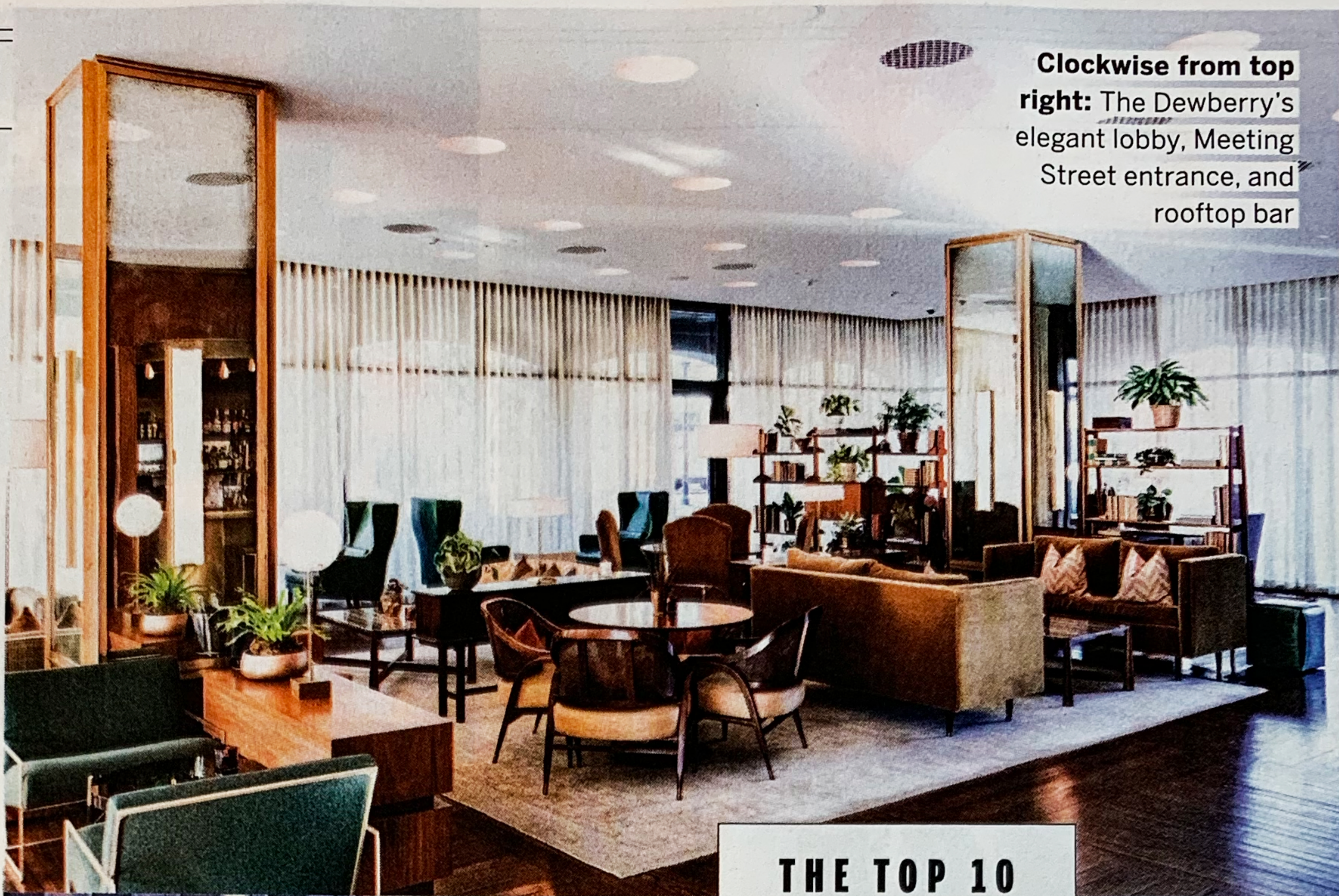
Clockwise from top right: The Dewberry's elegant lobby, Meeting Street entrance, and rooftop bar