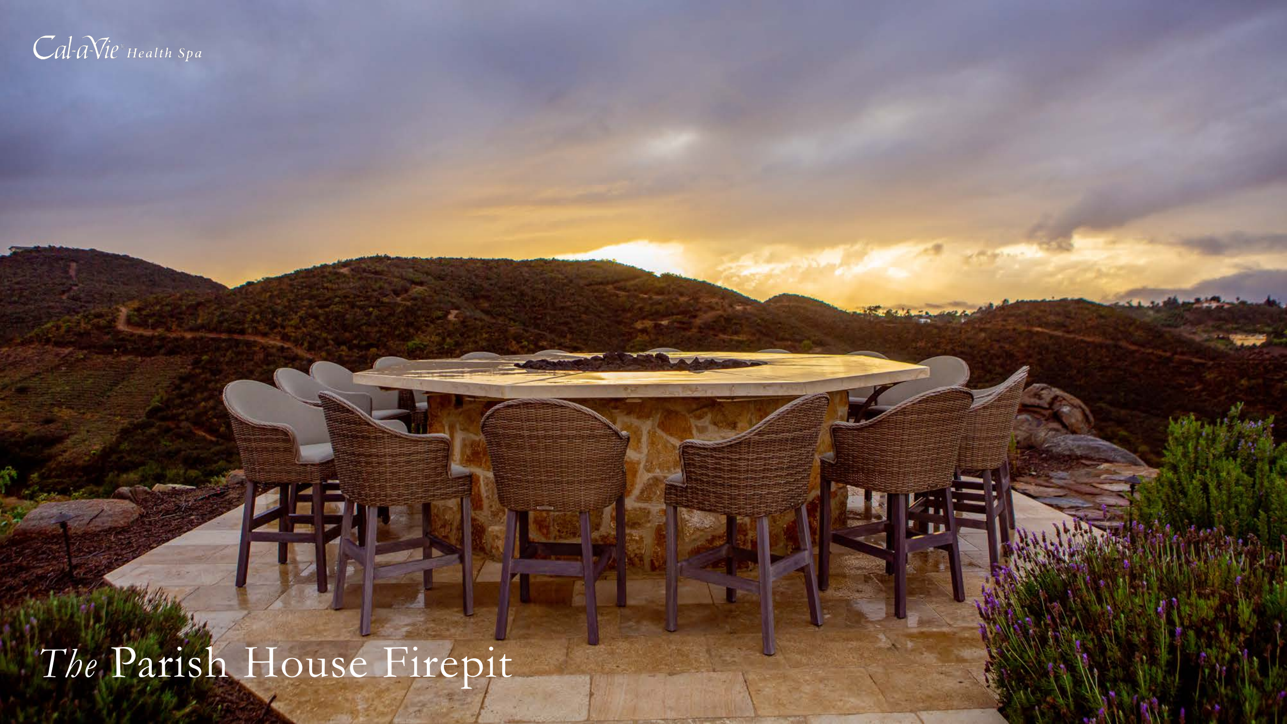
The Parish House Firepit