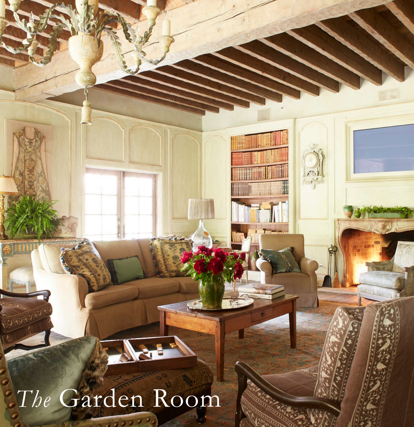
The Garden Room