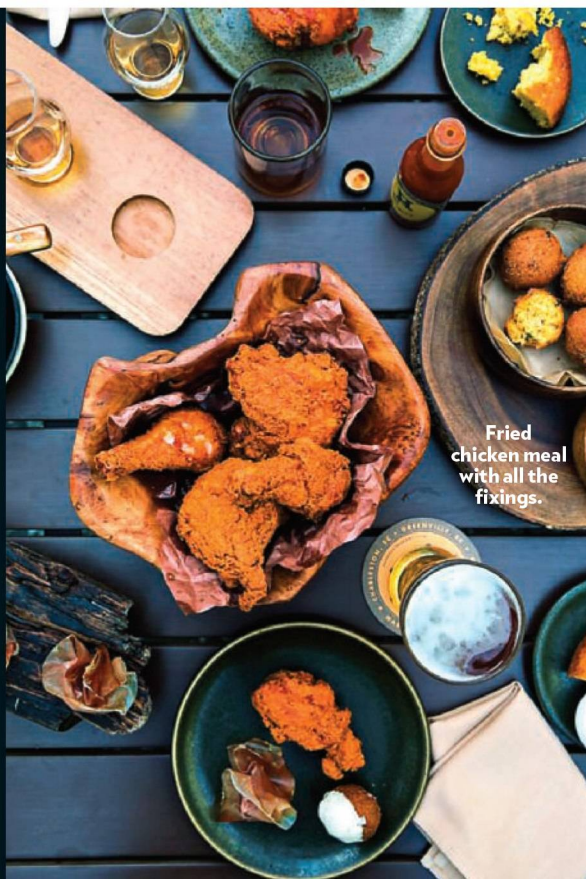
Fried chicken meal with all the fixings.

Familiar ingredients are transformed in unexpected ways by celebrated chef Sean Brock, who pushes the limits on southern cooking with a modern daily-changing menu fueled by locally available foods and delicacies pickled in-house. Word of advice: Order the fried chicken made with five different fats.