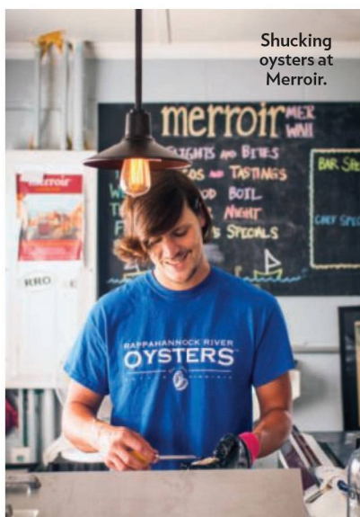
Shucking oysters at Merroir.

The sophisticated New American restaurant has been a fixture of Jackson's Town Square since it opened in 1993. It now serves elegant locally inspired fare, signature cocktails and hundreds of wines from across the globe.