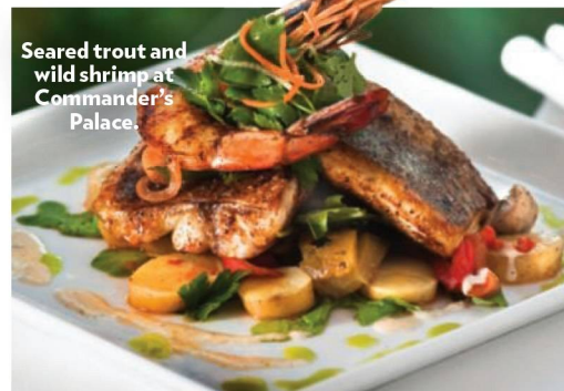
Seared trout and wild shrimp at Commander's Palace.

Hotel chef Fred Schmidt introduced fashionable late-night partygoers to the Hot Brown (an open-faced sandwich with turkey, bacon and Mornay sauce) decades ago; the