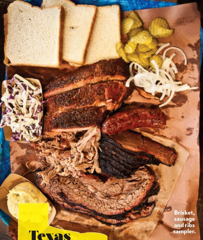
Brisket, sausage and ribs sampler.