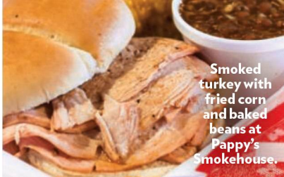
Smoked turkey with fried corn and baked beans at Pappy's Smokehouse.

One of the country's greenest and most sustainable restaurants, this spot with five-time James Beard nominee Clayton Chapman at the helm serves new