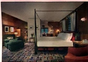
A room in the old farmhouse