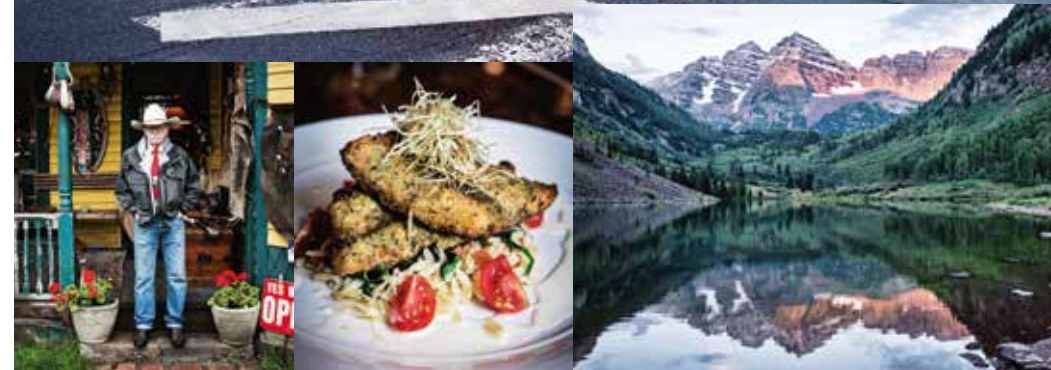
Clockwise from above: Aspen Art Museum; Hotel Jerome's lobby; 1950s styling at Boogie's Diner; a clothing stall at a rodeo; the Maroon Bells, two peaks in the Elk Mountains; mustard-crusted trout at Prospect; welcome to Alderfer Antiques.