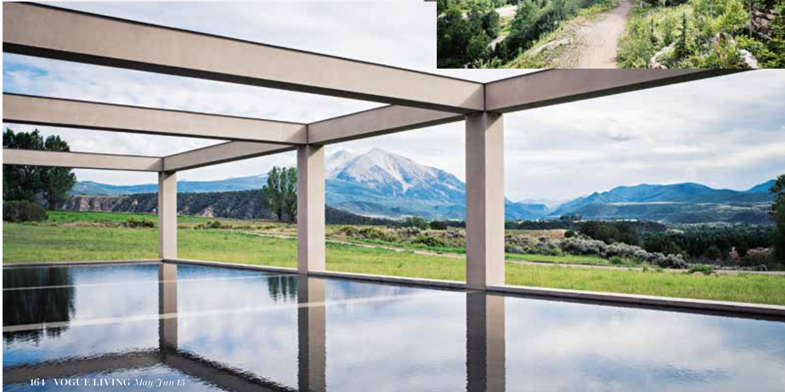
Clockwise from left: Aspen Art Museum's inaugural exhibition, David Hammons Yves Klein/Yves Klein David Hammons including an untitled 1960 Yves Klein work, Klein's Jonathan Swift (1960) and Pluie Bleue (1961), and a 1975 untitled David Hammons work; bowls from Anderson Ranch Arts Center's woodwork studio in Snowmass; the Viceroy hotel; the Powers Art Center.