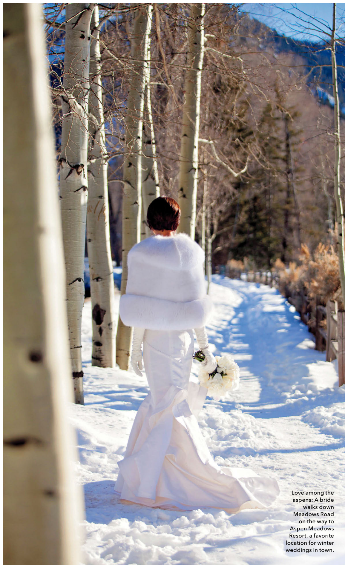
Love among the aspens: A bride walks down Meadows Road on the way to Aspen Meadows Resort, a favorite location for winter weddings in town.