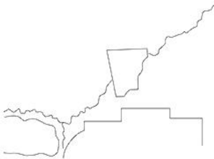
Lagoon Terrace Set-up

Classroom Style: 100 guests Horseshoe Style: 60 guests